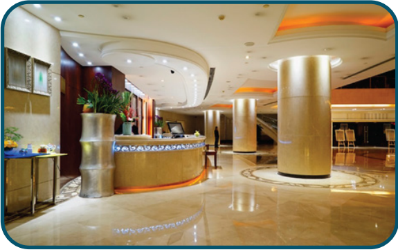
Hotel Entrances & Lobby Area